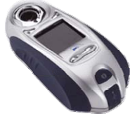
Part No: GEB103

The brand new PANTONE Color Cue™2 - the follow up to the top-selling PANTONE Color Cue and PANTONE Color Cue TX, combines two PANTONE Libraries in one hand-held device. Now get instant access to the colors in the PANTONE MATCHING SYSTEM® and the PANTONE Textile Color system® for fashion and home or architecture and interiors. Cross-match between these libraries for even greater versatility. The Color Cue™2 lets you easily capture any color that inspires you and translate it to the closest PANTONE Color. Move effortlessly from inspiration to realization. Integrating a desired color into your designs has never been simpler. The sleek, new, ergonomically designed Color Cue™2 is loaded with features that make it easier than ever to use. Noteworthy features of this affordable spectro-colorimeter include: