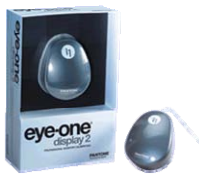
Part No: MEU103

Combination of tweaking and proofing might be eluding you simply because the color on your monitor is not accurate. The fact is, all monitors (yes, both new and old) display color differently. The only way to address this is by calibrating and profiling your monitor. Eye-One Display 2 is a professional monitor calibration tool that lets you achieve accurate color on all types of displays – including LCDs, CRTs and laptops. With its advanced controls, you can achieve the best possible match across multiple monitors, optimize gray balance for more neutral and better-defined grays and even check ambient light to determine optimal room lighting for color-critical work. Eye-One Display 2 saves time and rework so your creative inspirations can be more easily realized. Designed to meet the needs of creative professionals and discerning digital imaging enthusiasts, Eye-One Display 2 ensures reliable and accurate color onscreen. With the easy-to-use software wizard, you'll achieve consistent, predictable color on all types of monitors – LCD, CRT and laptops – with a few simple clicks. Each individual package includes an Eye-One Display measurement device (emission only colorimeter) with ambient measurement head, Eye-One Match 3.0 software for monitors, Eye-One Share software for creating, evaluating and communicating color, Interactive Training Modules and a digital Pantone library.