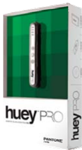
Part No: MEU 113

It's all about the color. Color in your photos, color in your designs, color online and more importantly, color on your display.