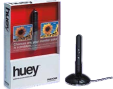
Part No: MEU101

Designed for calibrating and profiling all types of monitors – LCD and CRT. Each individual package includes a huey measurement device (emission only colorimeter) with ambient measurement capabilities, and software for monitor calibration. huey corrects the color on your monitor so photos and designs print more accurately, game graphics are more intense and movies are more true-to-life. Easy-to-use right out of the box, huey adapts your monitor for changing room lighting and applies your personal preferences for viewing accurate color all of the time.