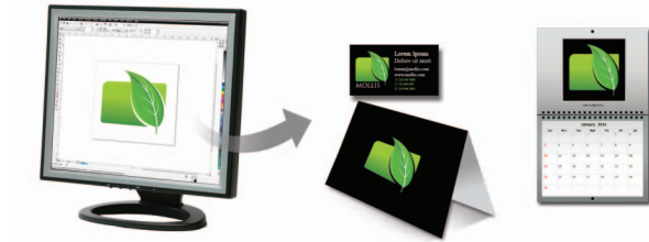
The completely redesigned color management engine accurately preserves colors during file import and export.

Control color consistency with a powerful new color management engine —Match the colors you see on screen across printed materials and Web graphics. A new color management engine enhances color consistency across all media and introduces support for new color profiles from PANTONE®. Minimize your ecological footprint and reduce costly reprints by knowing that your colors are accurate before you print.