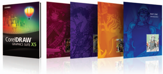
The box version of CorelDRAW Graphics Suite X5 comes with a hard cover, full-color, printed guidebook.

Work in the latest Windows® environment with optimization for Microsoft® Windows® 7 —Enjoy a hands-on experience with new touch-screen support for Windows 7 that lets you pan, zoom and scroll with your fingertips. This latest version is optimized for Windows 7, and also supports Windows Vista® and Windows® XP.